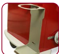
Oxygen tank holder (O2HLDR)