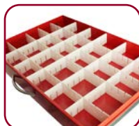
(1 Set) Standard 3" Drawer Dividers (MD30-DIV3-S)