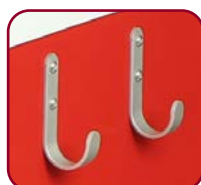
(2) Utility hooks (UHOOKS2)