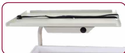
Defibrillator Shelf (MD-DEFIB)