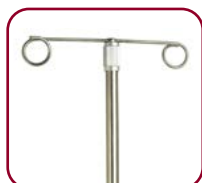
IV pole (MD-IV2)