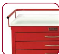
Toprail, matching cart color (MD30-TOPRAIL)