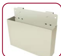
Chart Holder (CHARTHLDRDM)