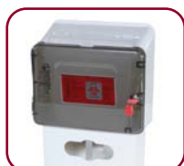
Locking Sharps Container (5qt) & Glove Box Holder (LKSHRPHOLD5Q-GLV)