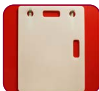
Cardiac board and brackets (MD-CARDBRD)