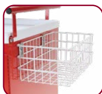
Large Utility Basket (BASKETDM)