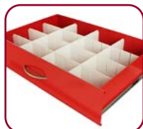
(2 Sets) Standard 6" Drawer Dividers (MD30-DIV6-S)