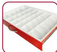
(1 Set) Standard 3" Drawer Tray Dividers (MD30-TRAYDIV3-S)